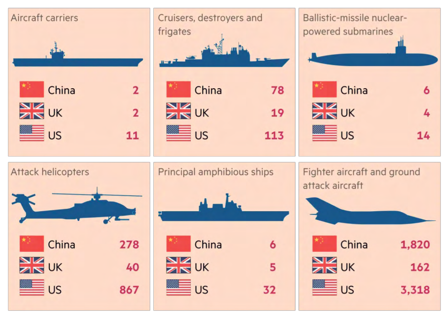
Figure 2 Military Assets by Country, 2021